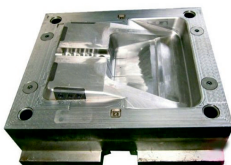
Dies & Moulds