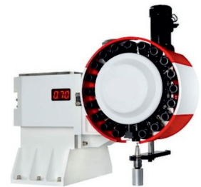
Arm Type Tool Changer