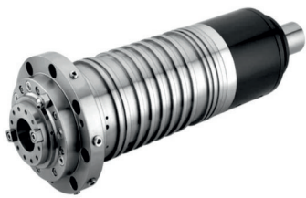
Cartridge type Spindle